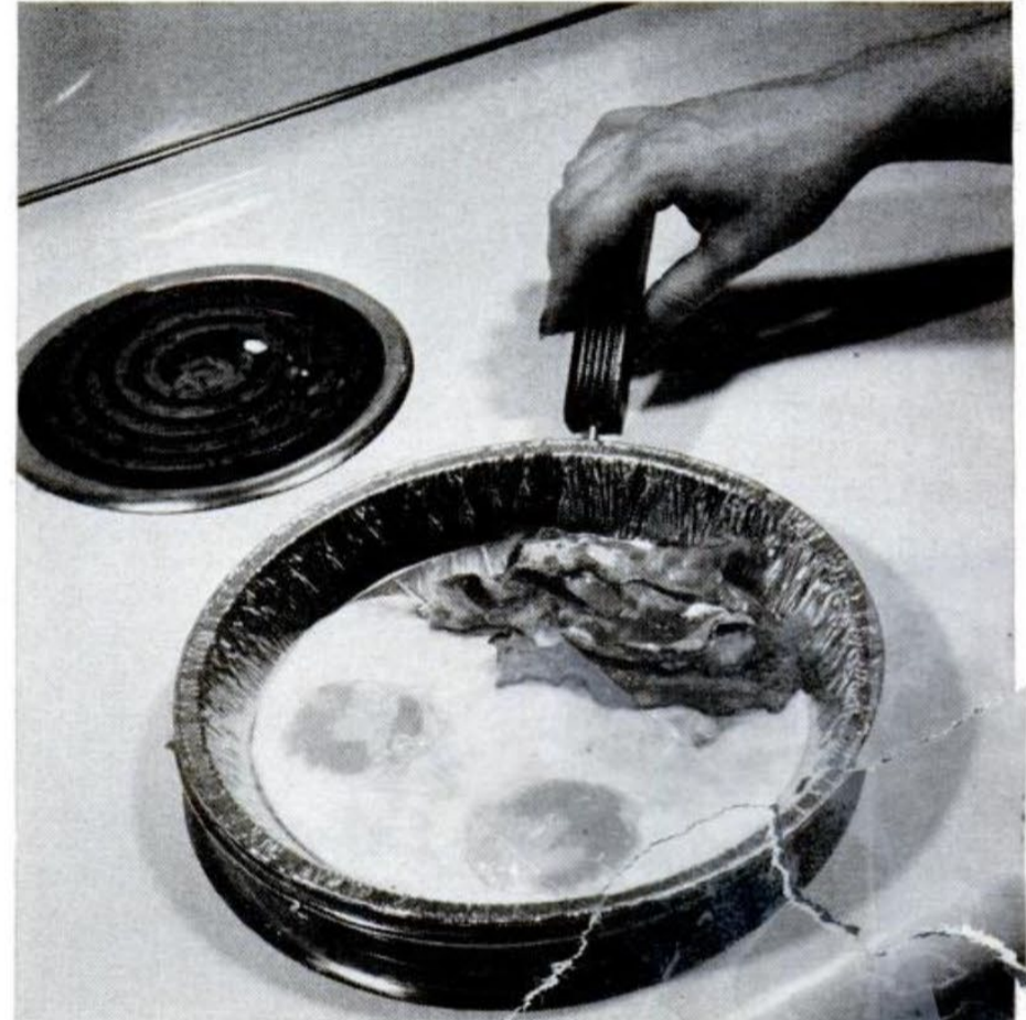
DISPOSA-PAN eliminates scouring of pots after cooking. It consists of steel frame and heavy foil pans to throw out. Frame with eight pans is $2.98.